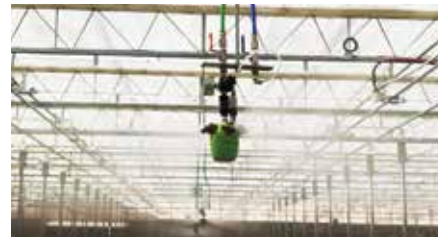
▲AKIMist® "E" Dry Fog humidifier with 4 nozzles attached

Thanks to the uniformed fog sprayed from the AKIMist®, it helped Walters Gardens to provide the best plants to their customers. The quality of the plants improved, they look healthy. And having a more uniform fog allowed them to produce plants more uniform in size and in development.