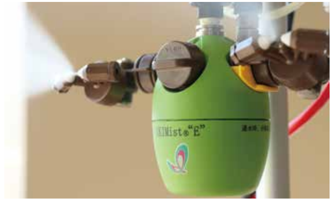
▲AKIMist® "E" with adaptors can control the direction of the spray depending on the installation

For inquiries, requests for materials, demonstrations, and estimates, please contact below. If you tell us that you have seen this interview leaflet, we can respond smoothly. Please feel free to contact us.