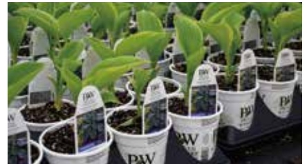
▲Walters Gardens' Proven Winners plants