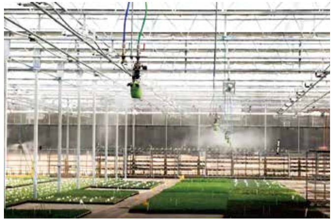
▲Walters Gardens greenhouse with AKIMist® "E" Dry Fog humidifiers controlling the humidity level

"I remember coming in, first thing in the morning, just seeing. You could tell as you walked in the ranges that humidity was definitely higher. And able to maintain that too." (Drew)