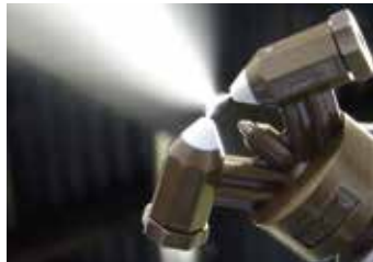
▲Close view of the nozzle tip principle