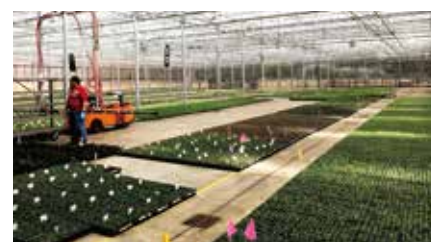
▲Walters Gardens greenhouse with AKIMist® "E" Dry Fog humidifier

2) Uneven development of the plants within the same area, due in part to uneven moisture at the plant level. Because of uneven fog sprayed, some trays had obvious spots of moisture, making the plants with more water grow faster.