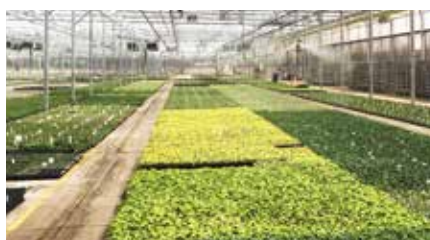
▲Walters Gardens greenhouse with AKIMist® "E" Dry Fog humidifier

Their mission is to provide the best high quality products to their customers across the US and Canada.